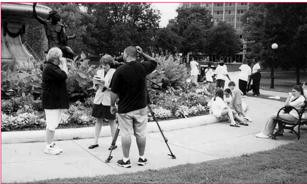
Interview at Connecticut Community for Addiction Recovery (CCAR)'s Recovery Walk!